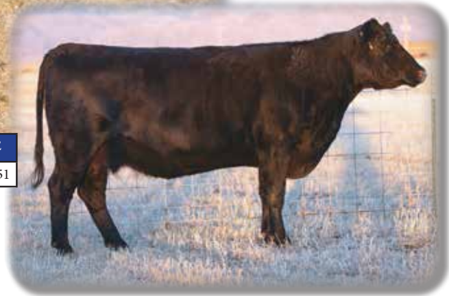
Gunsmoke's dam - 1421